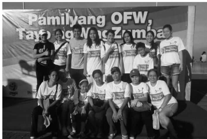
DAWN staff, volunteers and members who participated in Philhealth's Zumba marathon held at the MOA grounds on December 9