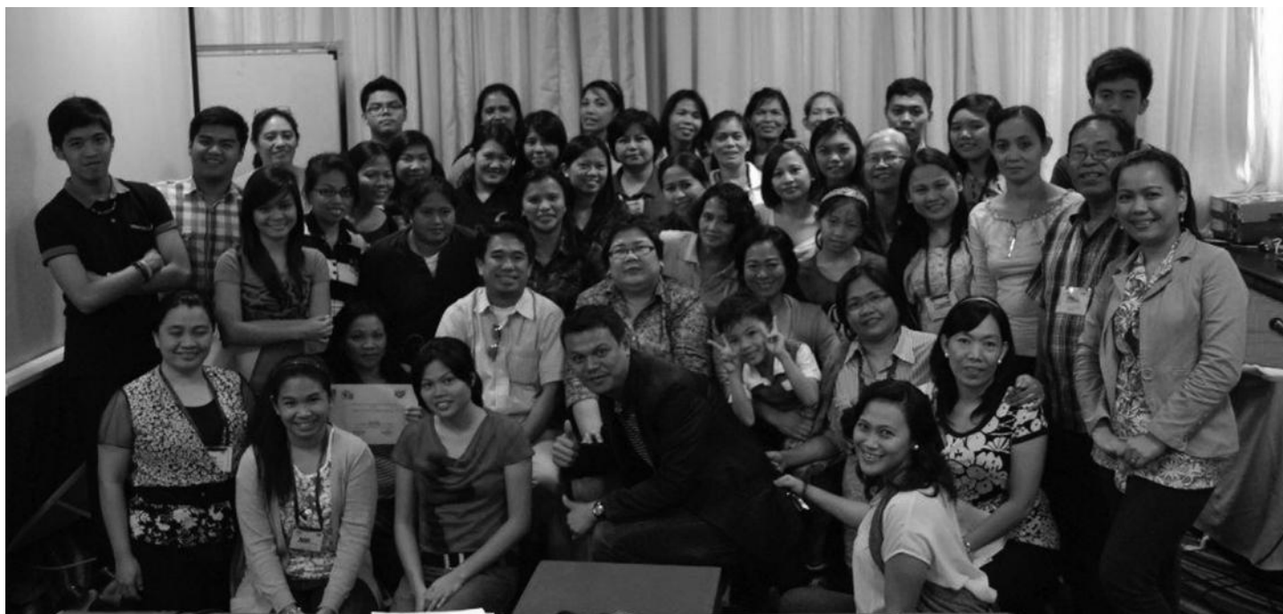
Participants to the seminar-workshop on Revisiting R.A. 9208