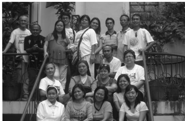
DAWN staff attended the PMRW Capacity Building seminar held in Antipolo City from October 18-19