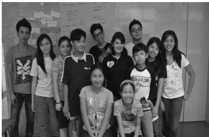
DAWN-JFC elected their new set of officers last October 26