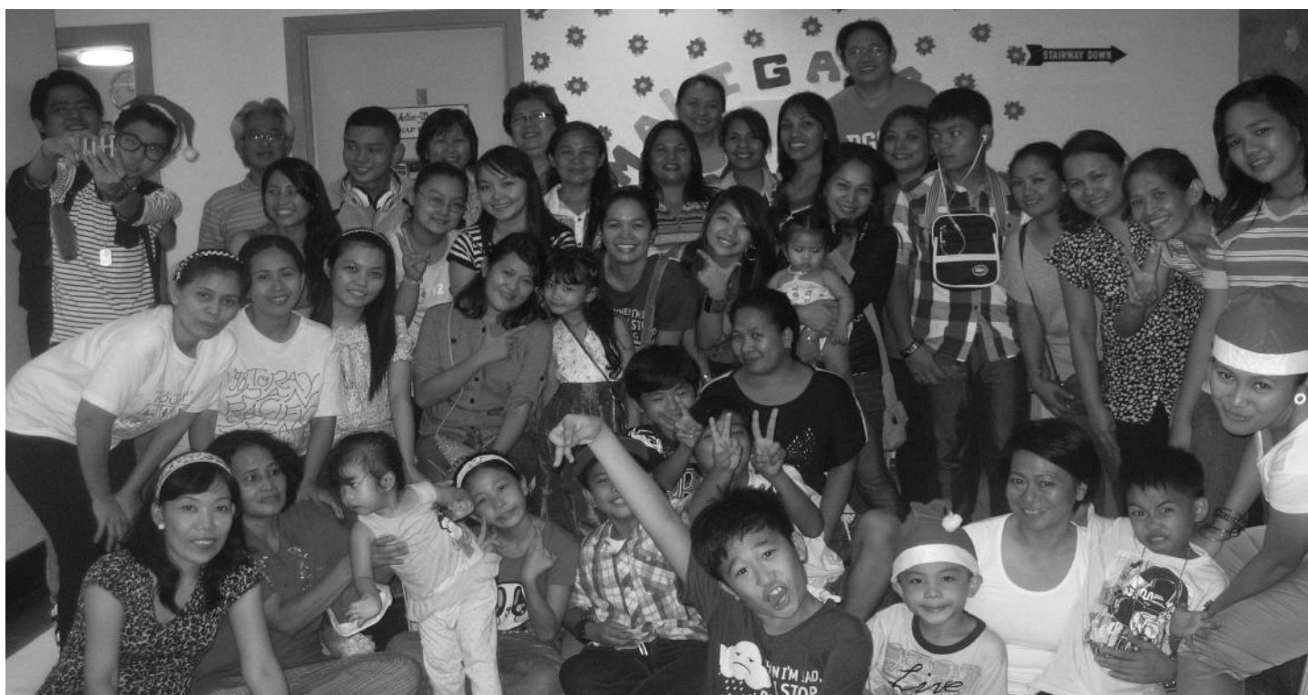
The DAWN Family Christmas Get-Together 2012