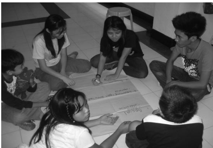
Leadership training for DAWN's children members

DAWN remains a member of various networks and alliances that advocate issues on migration, women and children. It is a member of the Philippine Migrants Rights Watch, with DAWN Executive Director serving as its President for the past several