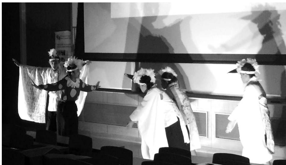
DAWN Teatro Akebono performing "The Crane Dog" at Saitama University on May 26, 2016