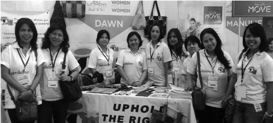
DAWN staff and women members participate during BDJ's 10th Anniversary entitled "Women Helping Women" on April 16, 2016 at Samsung Hall, SM Aura.

On April 16, 2016, the Development Action for Women Network (DAWN) was invited as partner organization of Belle de Jour, a power planner which aims to empower women through its mantra, "live life to the fullest". The "BDJ Women's Summit: Women Helping Women" was held at the Samsung Hall, SM Aura Premier.