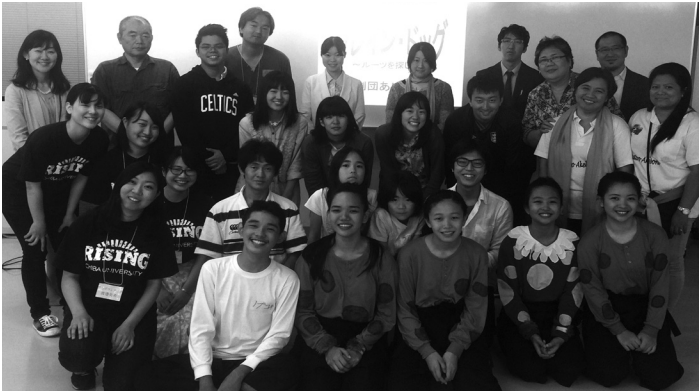
With professors, students and guests from Chiba University.