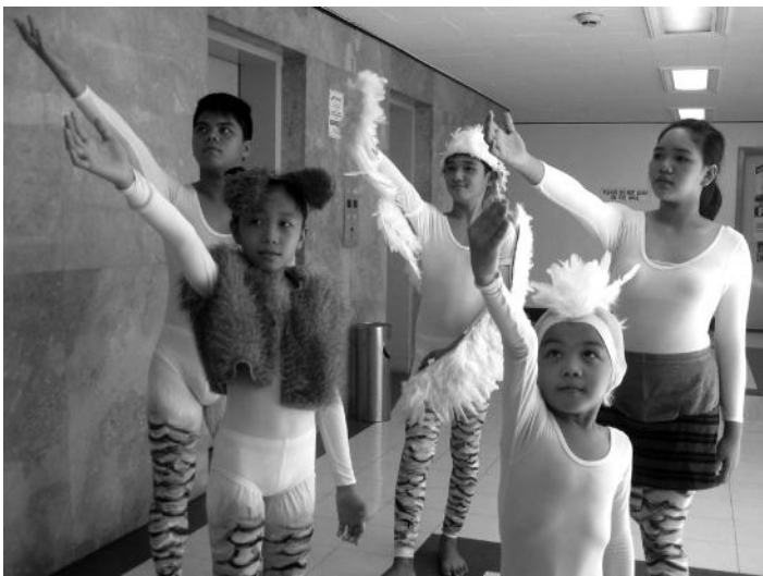
The Crane Dog Rehearsal

The cast of “The Crane Dog” will then leave for Japan on May 18, 2013 for a series of presentations and interactions with university students and Japanese children in several prefectures in Japan such as Chiba, Tokyo, Yokohama, Saitama, Nagoya and Osaka. The group will be back to Manila on May 31, 2013.