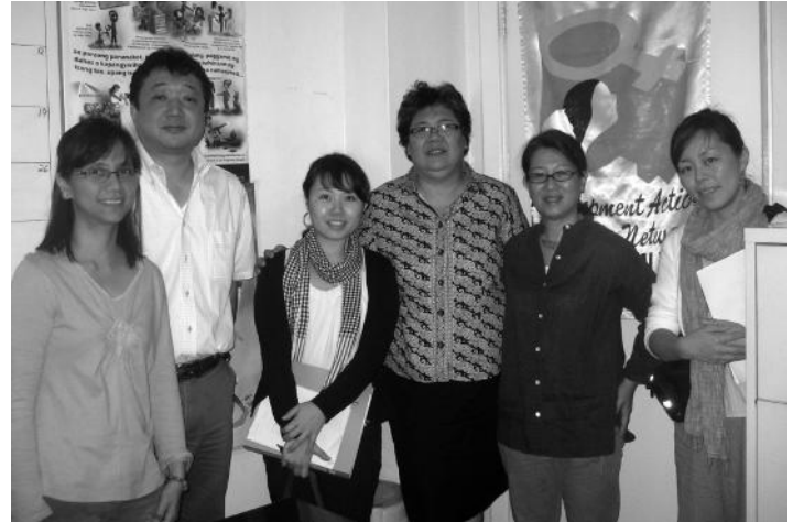
Members of the Grassroots Human Security Projects (GGP) Evaluation Team from the Ministry of Foreign Affairs (MOFA), Japan Philippines Network (JPN) and Philippine Japan NGO Partnership (PJP) visit DAWN's projects last January 22, 2013