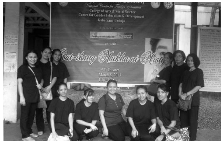
Teatro Akebono's performance of "Iba't-Ibang Mukha ni Misty" in a joint celebration with the Philippine Normal University to commemorate International Women's Day last March 8, 2013