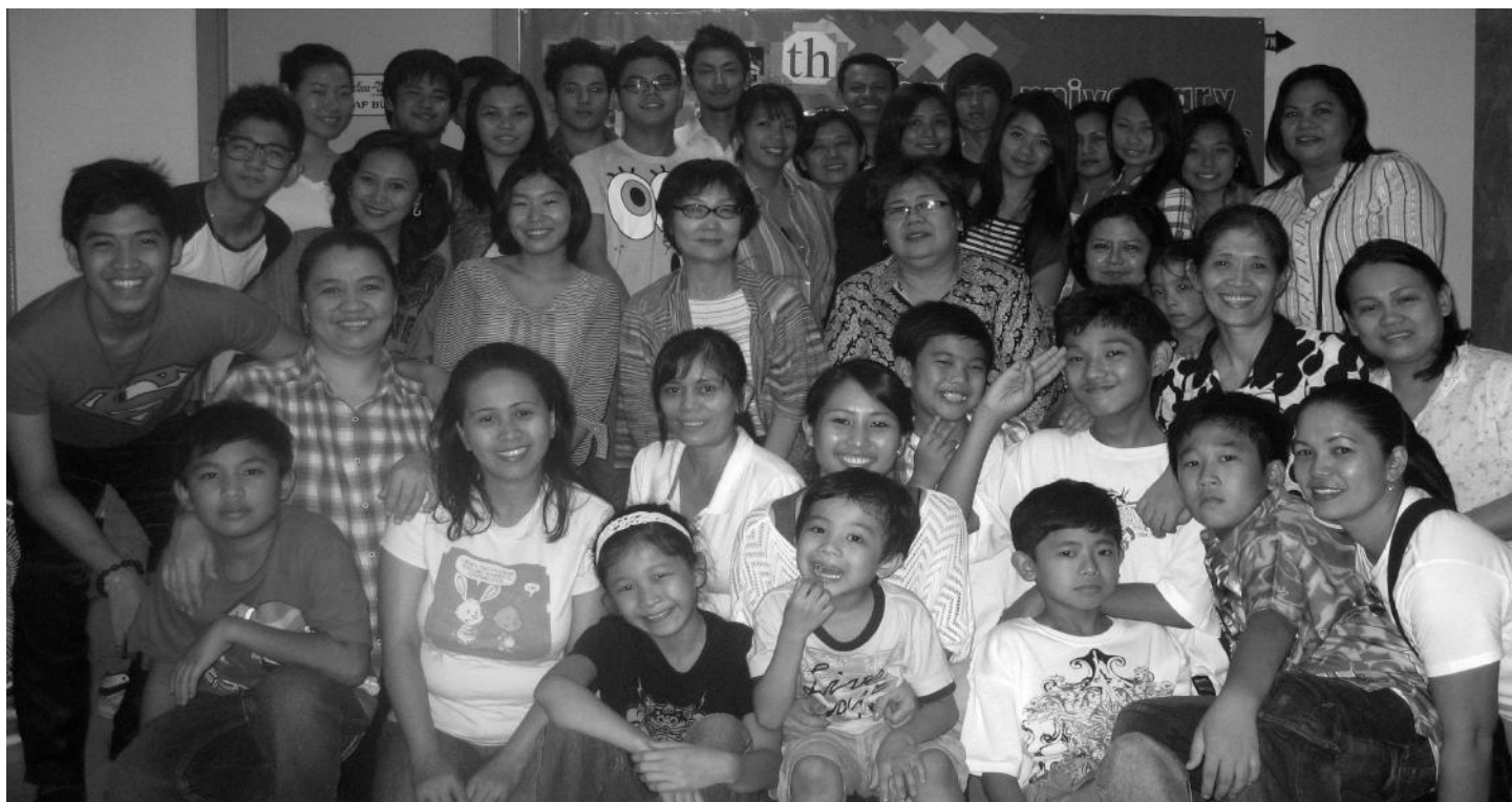
The DAWN Family